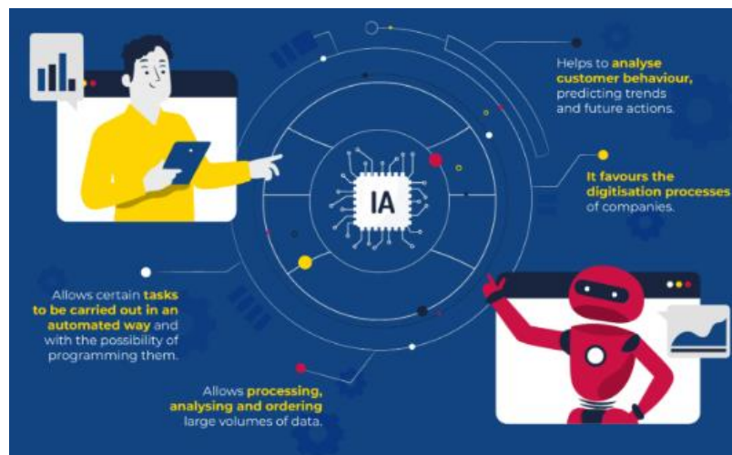
Figure 2. Benefits of AI in SMEs (Acelera Pyme, 2024)

Nevertheless, there is high optimism regarding the potential use of AI if properly guided and supported. Some respondents expressed willingness to try new technology if it could demonstrably improve efficiency or revenue. This aligns with findings by Chatterjee et al. (2021), which emphasize that perceived benefits of technology strongly influence the intention to adopt digital technologies among small business actors. The following figure, Benefits of AI in SMEs, illustrates how AI has transformed the business market by providing various advantages in both internal processes and interactions with customers or suppliers.